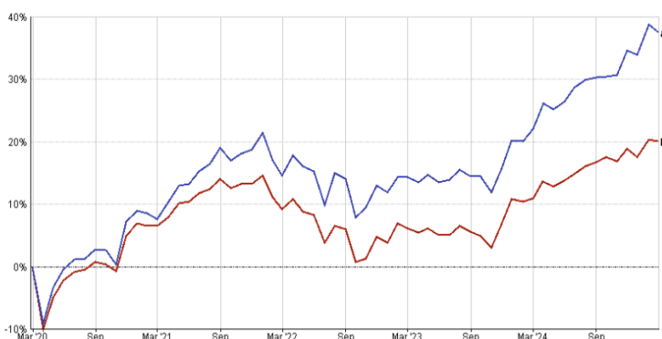
Performance compared to the IA 20-60% sector over the past five years to end of last month, income reinvested. (Blue line = CDI portfolio, Red line = benchmark).